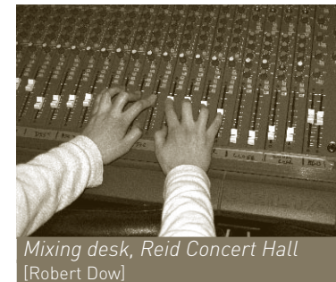
Mixing desk, Reid Concert Hall