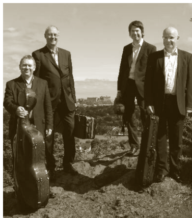
The Edinburgh Quartet