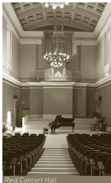
Reid Concert Hall

Friday 8 April, 7.30pm Reid Concert Hall