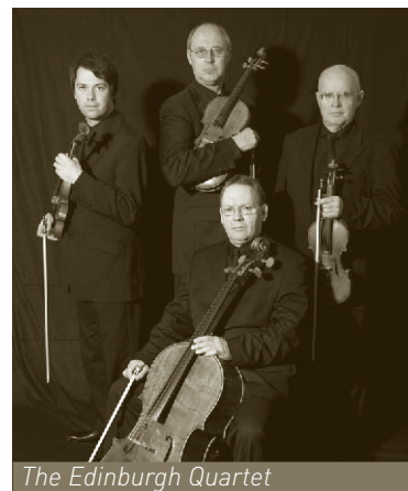
The Edinburgh Quartet