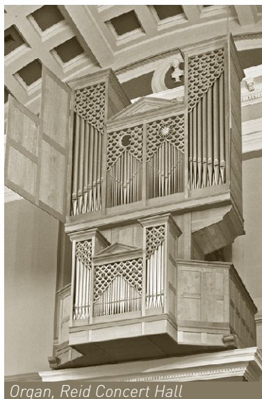
Organ, Reid Concert Hall